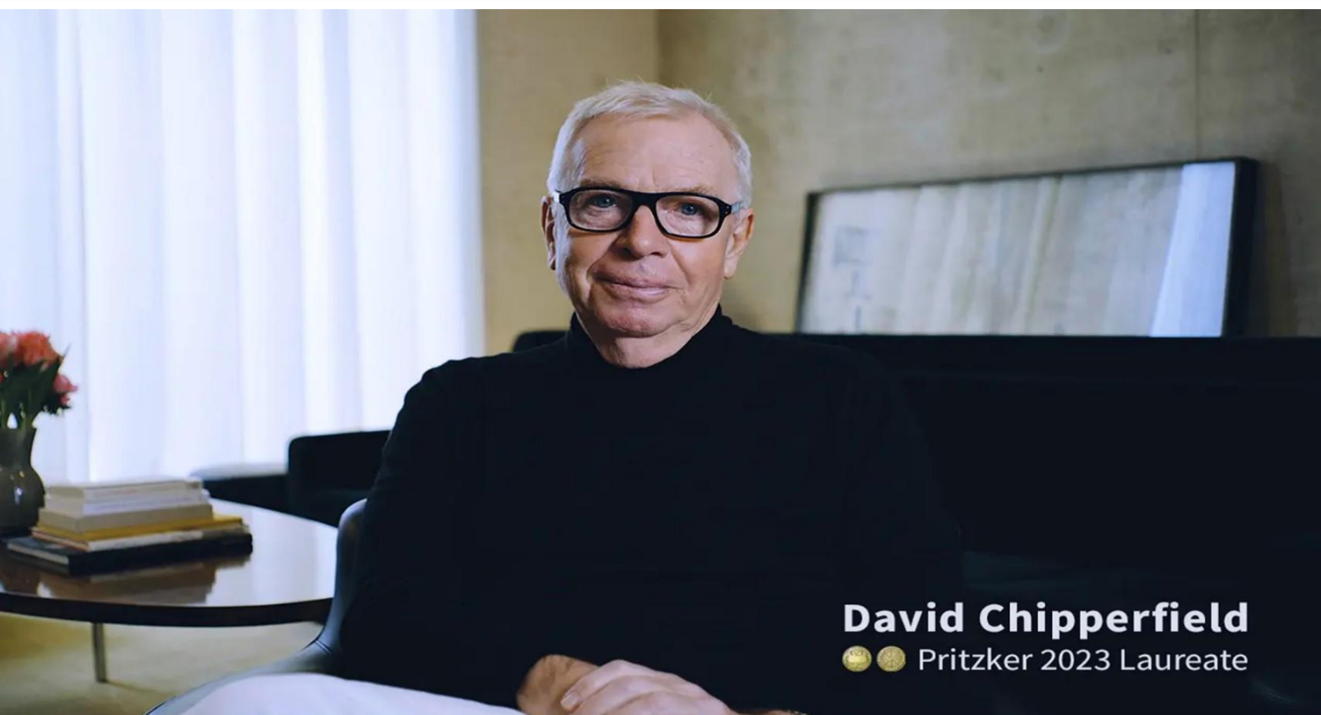
David Chipperfield Pritzker 2023 Laureate