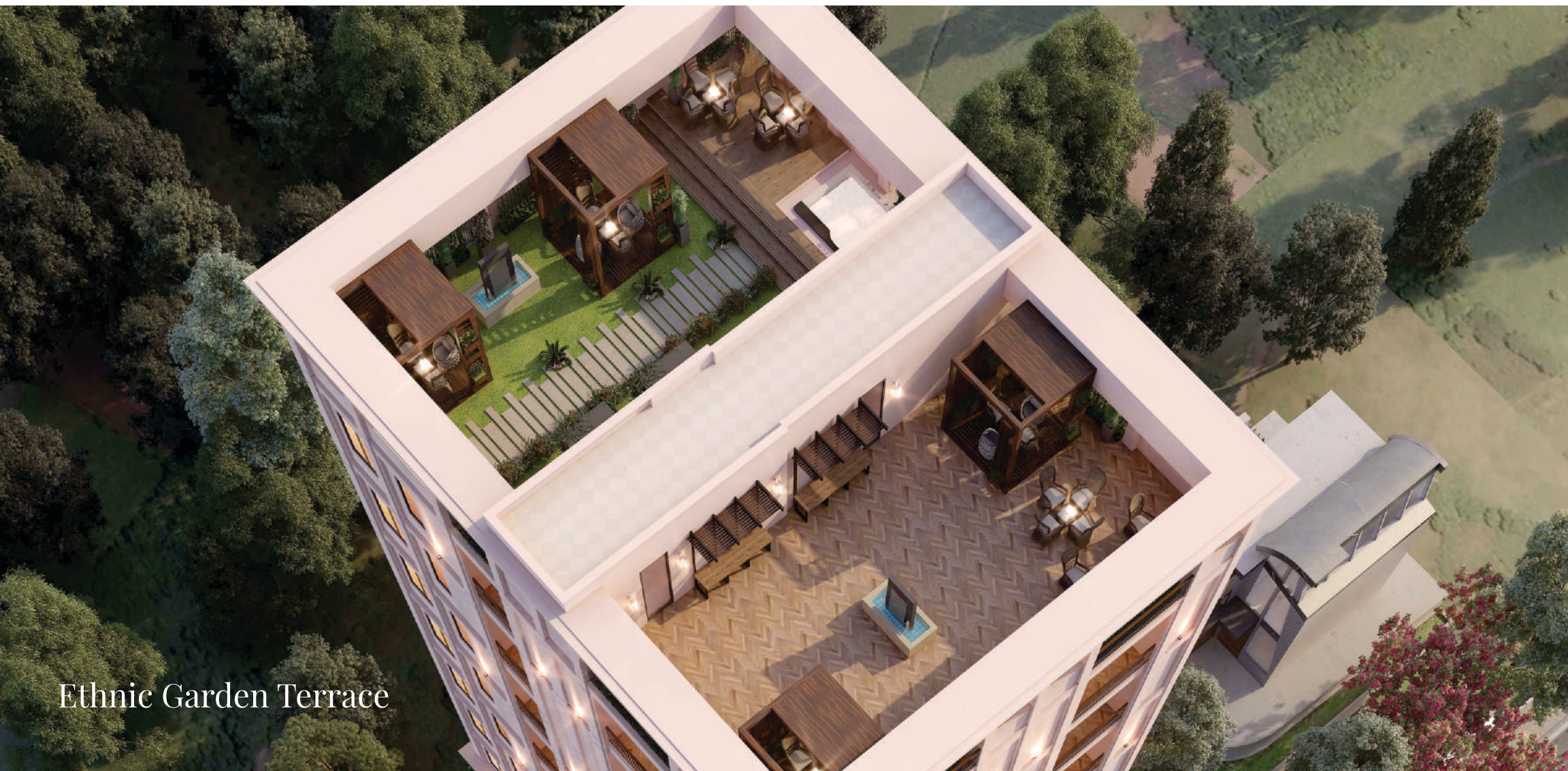
Ethnic Garden Terrace