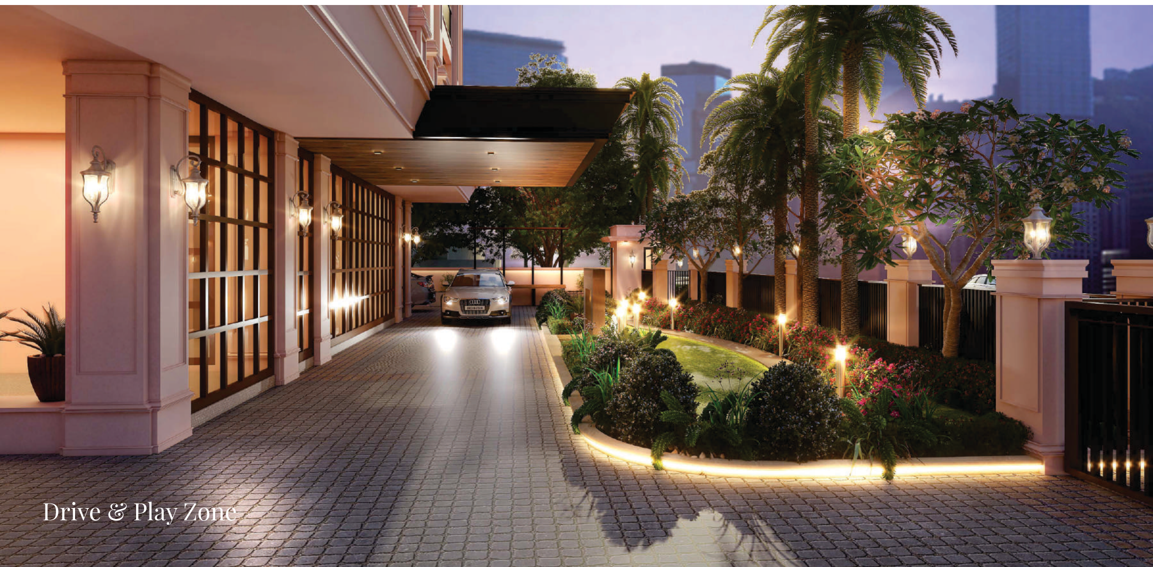
Drive & Play Zone